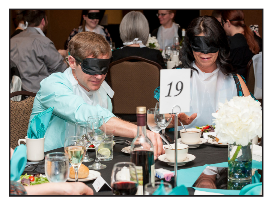
(Above) Guests enjoy navigating their entree plate while wearing blindfolds.

Over 20 local companies sponsored the event, and nearly 180 guests attended. Excellus Blue Cross Blue Shield and M&T Bank were our Gold level sponsors; Bob Carr 2.0 was our print sponsor; Ophthalmic Associates was our